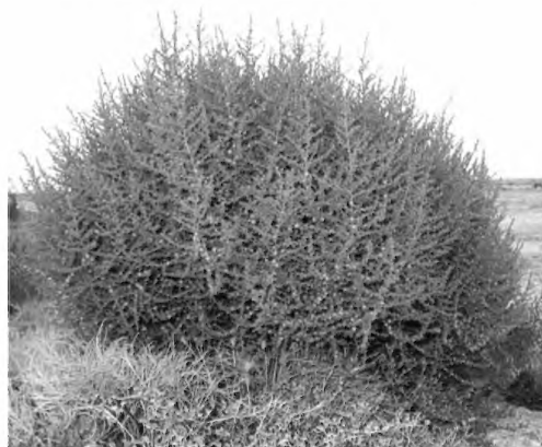
Fig. 1. Salsola australis subsp. Coastal , habit — R.J.Chinnock 10246.

Hrusa & Gaskin found two pre-existing names were available for their Salsola 'type B'. The holotype specimen of S. kali subsp. austroafricanus Aellen (1938) held at Munich (M) and the lectotype (BM) of Salsola australis R.Br (1810) matched 'type B' closely. The fertile allohexaploid ('type C') was described as a new species, S. ryanii Hrusa & Gaskin. Interestingly,